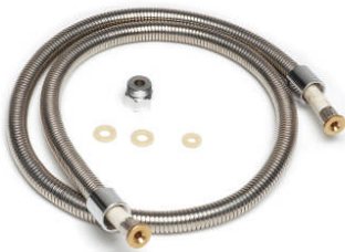
16-HU44 44" Stainless steel pre-rinse hose