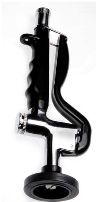
37421 Spray Valve

Stainless steel spring for pre-rinse units