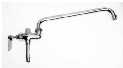
BF-2 12" Add On Faucet